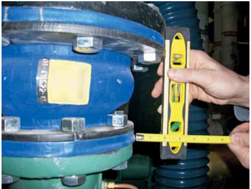
Figure 1. Verifying the lateral offset

Installation cost can be reduced based on the field survey. The manufacturer can produce the optimum joint size to fit your opening. This will allow the joint to be installed stress