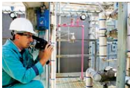
Figure 1. Infrared leak detection

Today, single point organic vapor analyzers (OVAs) and toxic vapor analyzers (TVAs) are used to monitor each possible point of VOC emissions. EPA Method 21 determines the