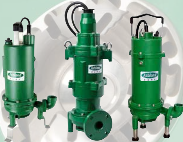
AGPR Single Seal Grinder