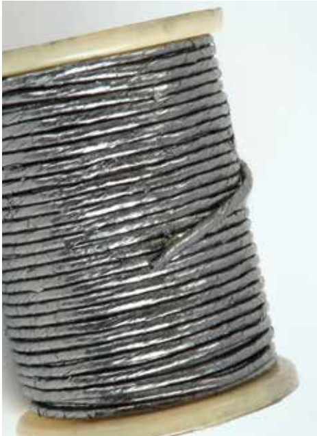
Image 4. Thermacord flexible graphite packing yarn

for inorganic chemicals includes molten sodium, potassium hydroxide and chlorine dioxide.