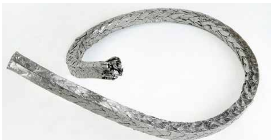
Image 2. Thermabraid braided gasket packing