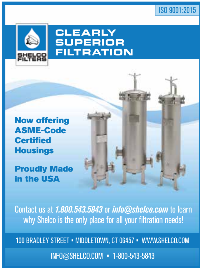
Circle 139 on card.

The new information with the existing material provides an invaluable tool to engineers and technicians who specify or use compression packing as a modern solution to their sealing needs. It addresses the needs for dynamic applications in rotating