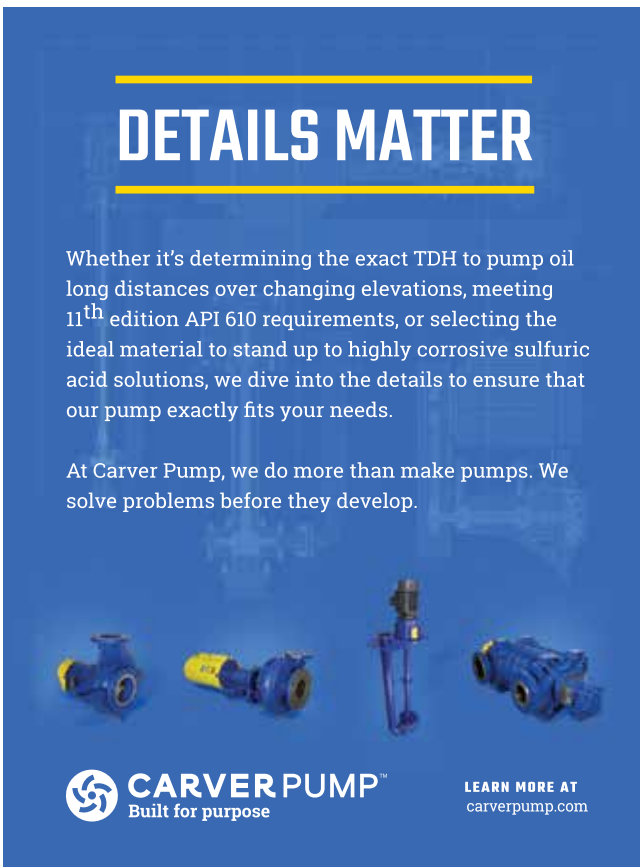
Circle 138 on card.